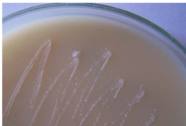
Figure 3. Lactobacillus acidophilus strain non-producing hydrogen peroxide on TMB-Plus medium

Rycina 2. Szczep Lactobacillus acidophilus wytwarzający H_2O_2 na podłożu różnicującym TMB-Plus